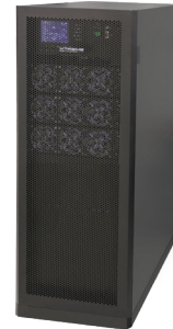
UPS Systems | Mitsubishi Electric | Xtreme Power Conversion